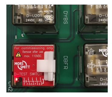
Test for voltage presence: Voltage is present (LED indicator ON)