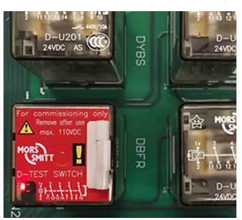
Test system by simulating energized relay: Contacts are manually switched