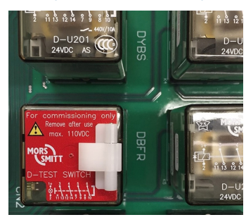
Test for voltage presence: No voltage present (LED indicator OFF)

Testing and commissioning electrical installations. Can be used for maintenance purposes and fault finding.